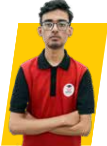
KULSHRESTHA CLASS XI 2023